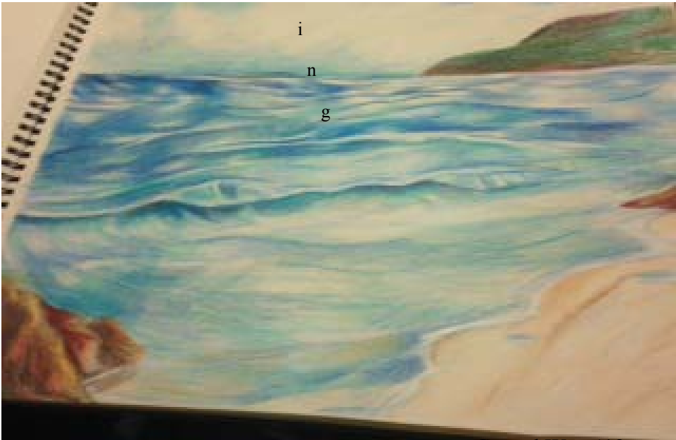
Crystal West '18