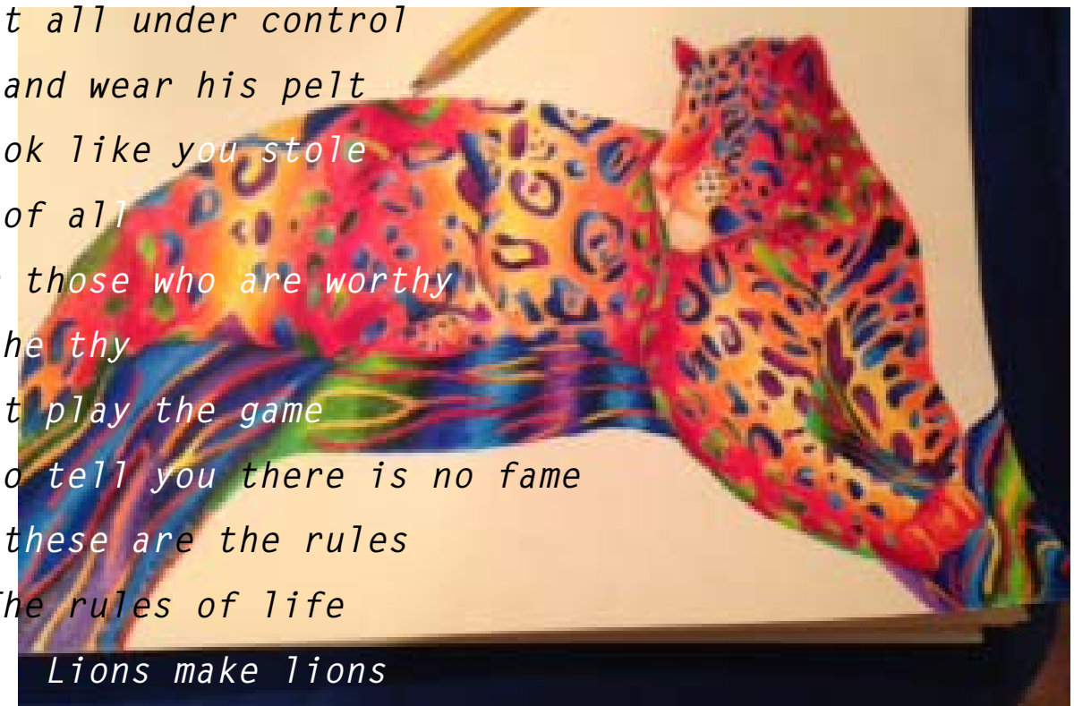
Crystal West '18

"Lions don't head to the words of a sheep"