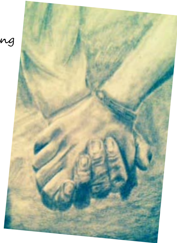
Artist: Crystal West '18

Or from the frost touched by morning light